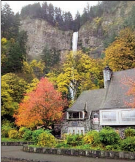
The Falls and the Lodge - Fall 2011