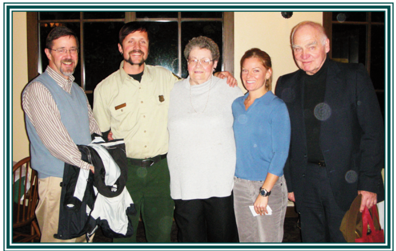
Annual Meeting 2009

Election of Board Members & Officers Volunteer Recognition and Special Awards