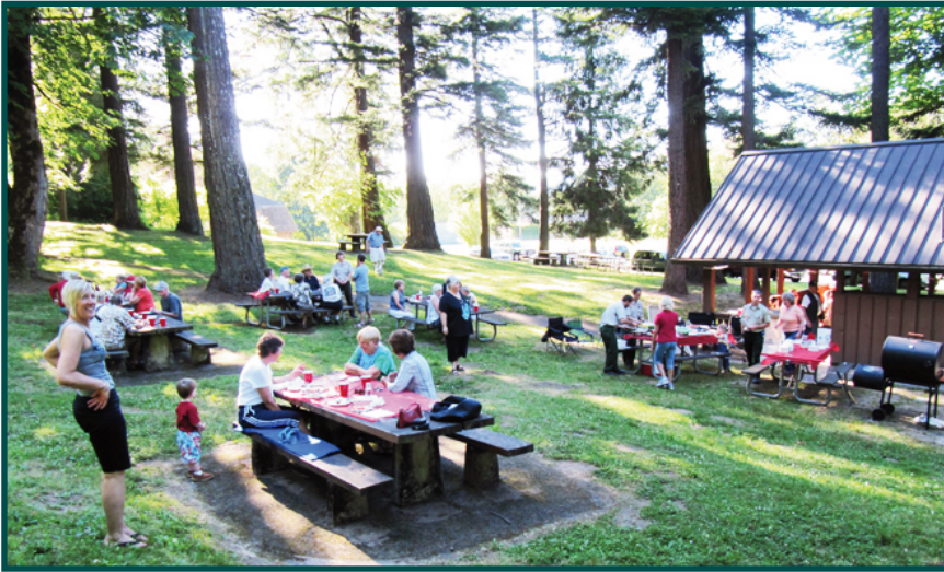
FOMF Picnic 2010 at Guy Talbot Park near Latourell Falls