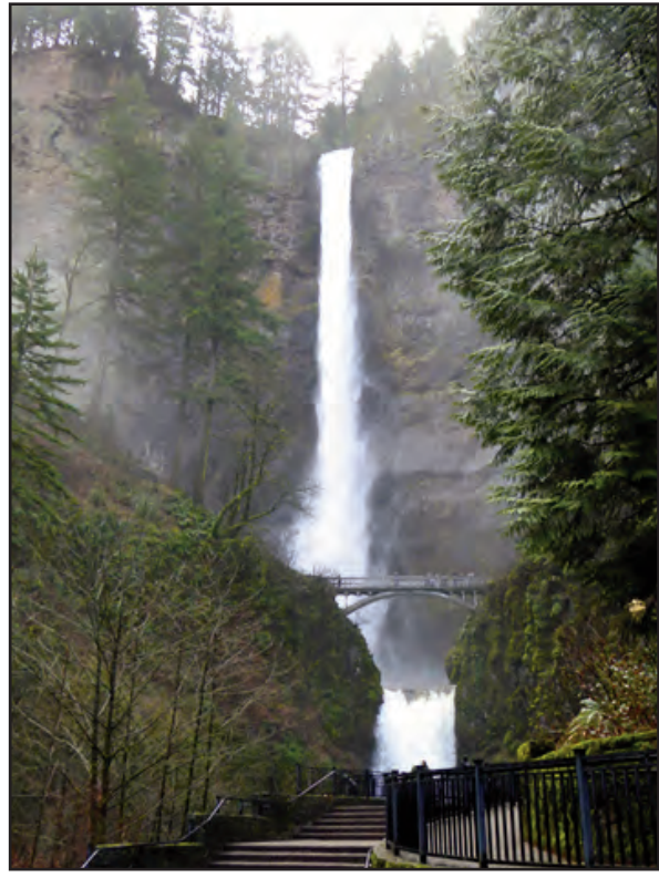
Multnomah Falls in January 2016

✤ It would take Multnomah Falls about ten hours to fill the lock at Bonneville.