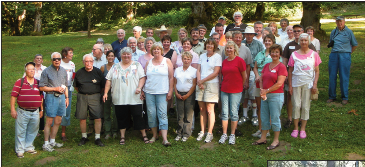
Annual Volunteer Photo - 2009

Let's have the best Picnic we've ever had. Mindy says the ribs will be smoking when you get there. And don't forget, it's the Annual Volunteer Photograph - so be there!!