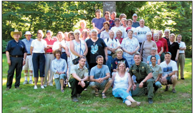
Group photo of the volunteers in the park at the picnic - 2010

And don't forget, we'll be taking the Annual Volunteer Photograph - so be there!!