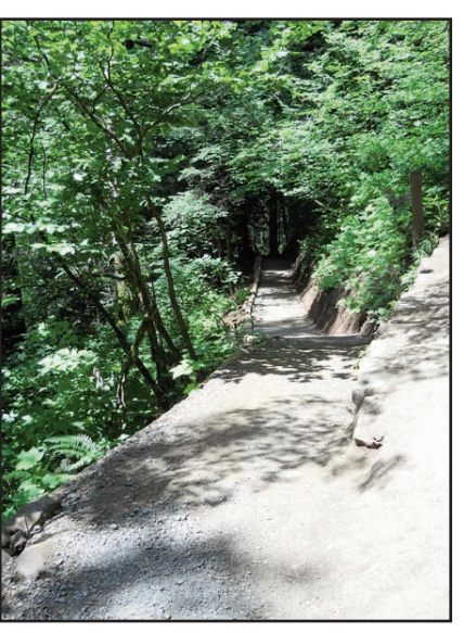
Photo of the new Spur Trail to the top of the Falls Viewing Area - by Nicole LaGioia 2013