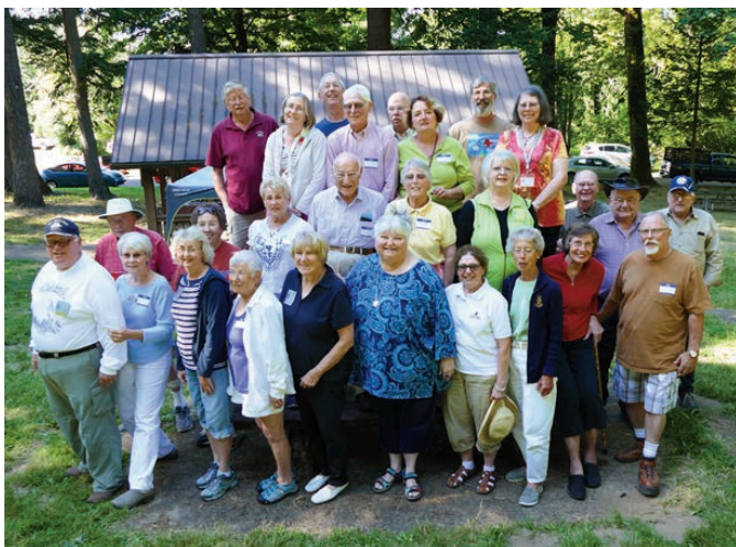
Annual Photo of Volunteers at the Picnic - 2016

Please bring your own picnic basket with plates, napkins, cups and utensils and a fun tablecloth for the tables. We are "GREEN" !