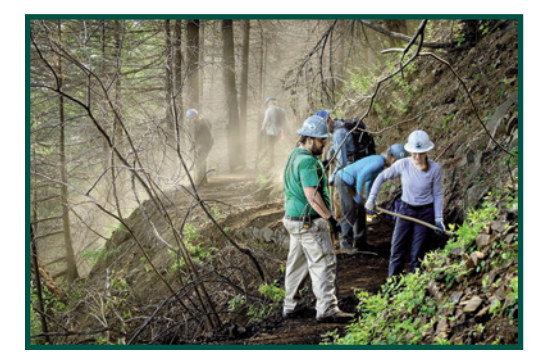
Trail Crew at Work

If the public wants up to date information on the happenings of the Eagle Creek Fire recovery effort or when trails will become open, going to bit.ly/eaglecreek-firesponse is a good start. Calling the Columbia River Gorge National Scenic Area office up in Hood River is another way to get updates. Their number is 541-308-1700. Finally watching for news releases from the Scenic Area or local newspapers/news channels are timeless resources that we shouldn't forget about.