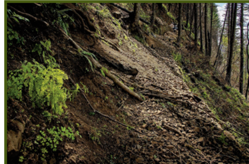
Above: Trail Crew at work

Left: Trail covered in rock fall debris - before clearing by crew