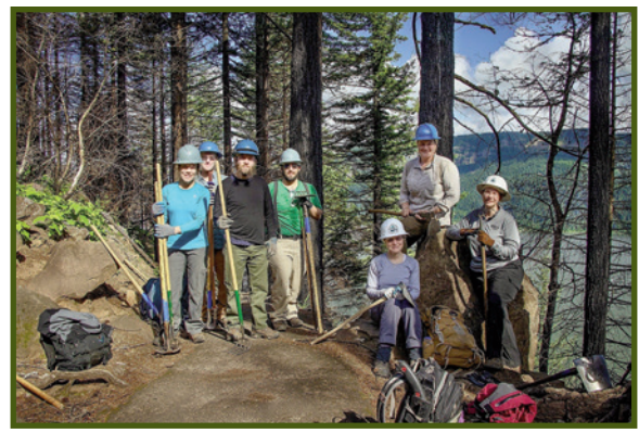
Trail Crew at work by Terry Hill