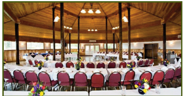
Air Conditioned Pavilion Interior