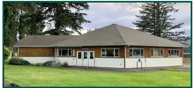
Pavilion near the Cascade Locks Sternwheeler Building

Please bring your own picnic basket with re-usable plates, napkins, cups, utensils and a fun tablecloth for the tables. We are "GREEN"!