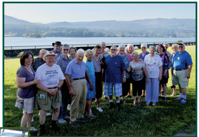
Volunteer Picnic Group Photo - 2018