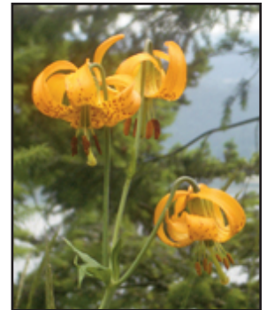
Native Wildflower - Columbia Tiger Lily by Teresa Kasner.

Come join in for a morning of gardening Thursday, April 12th from 9:30 am - 12 noon. After their long winter nap our wanted plants need to be rescued from the weeds that did not nap! A snack will be provided so we have an excuse to stop to discover if we can still reach an upright position after all that bending over. On Thursday, May 10th we will do a quick re-weed, spread bark dust, put plants in the gift shop beds and any other planting that we decide to attempt. We have a pretty good selection of tools and plenty of buckets. You do need to provide your own gloves and certainly bring your favorite weeding tool if you would like. Contact Katie Goodwin to confirm or for further info: 503-761-4751