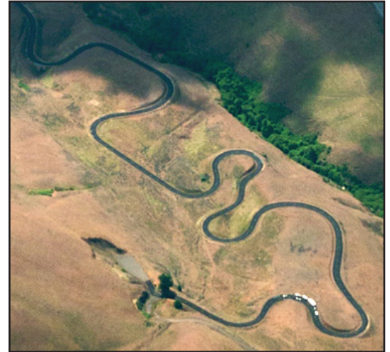
Top - Maryhill Museum Bottom - The Maryhill Loops