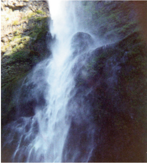
Photo by Alan Thompson - 1980s This is a photo of the "Maiden of the Falls" See photo & legend on the FOMF Website - http://friendsofmultnomahfalls.org