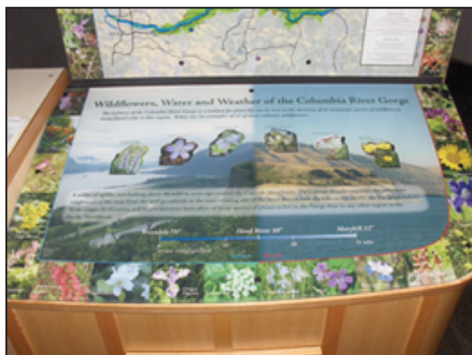
Above - the new wildflower display

If you receive this newsletter as a hard copy and sent "snail mail" be sure to check the newsletter out on the website to enjoy the photos in full color! http://friendsofmultnomahfalls.org/newsletter.html