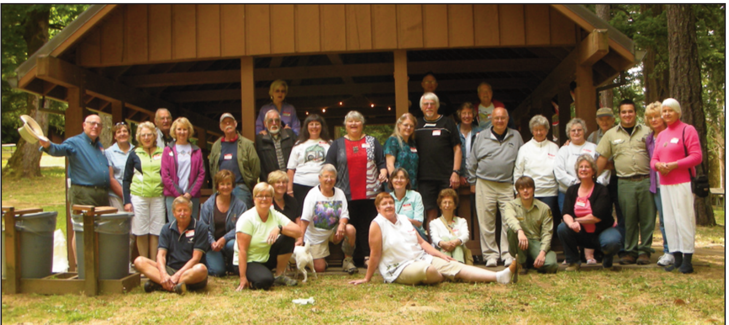
The Volunteers & Board Members pose in front of the Picnic Shelter at Guy Talbot State Park during the FOMF Annual Picnic

FOMF Picnic on JULY 27th, 2008 at Latourell Falls