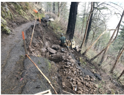
Slide area switch back 5-6