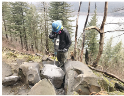
New Corona rock drill